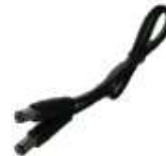
DC Chain Cord