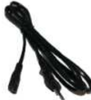
EU or US Patch Cord