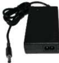
International Power Supply