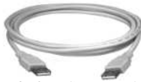
USB Cable (for powering)